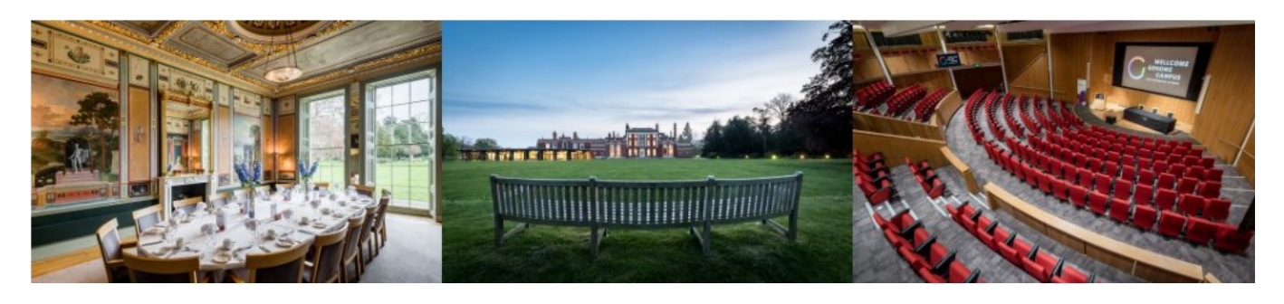
FREE Entry for Foundation Year and Medical Students through 'Enhancing Foundation Experience in Psychiatry' initiative of HEEoE School of Psychiatry