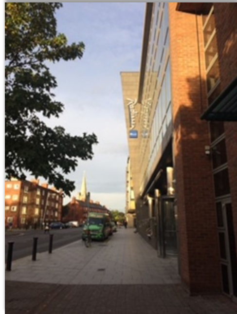
Sunshine in Dublin