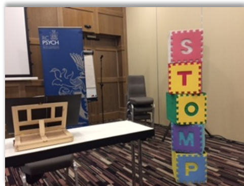
A moving performance on STOMP by Mixit Days.