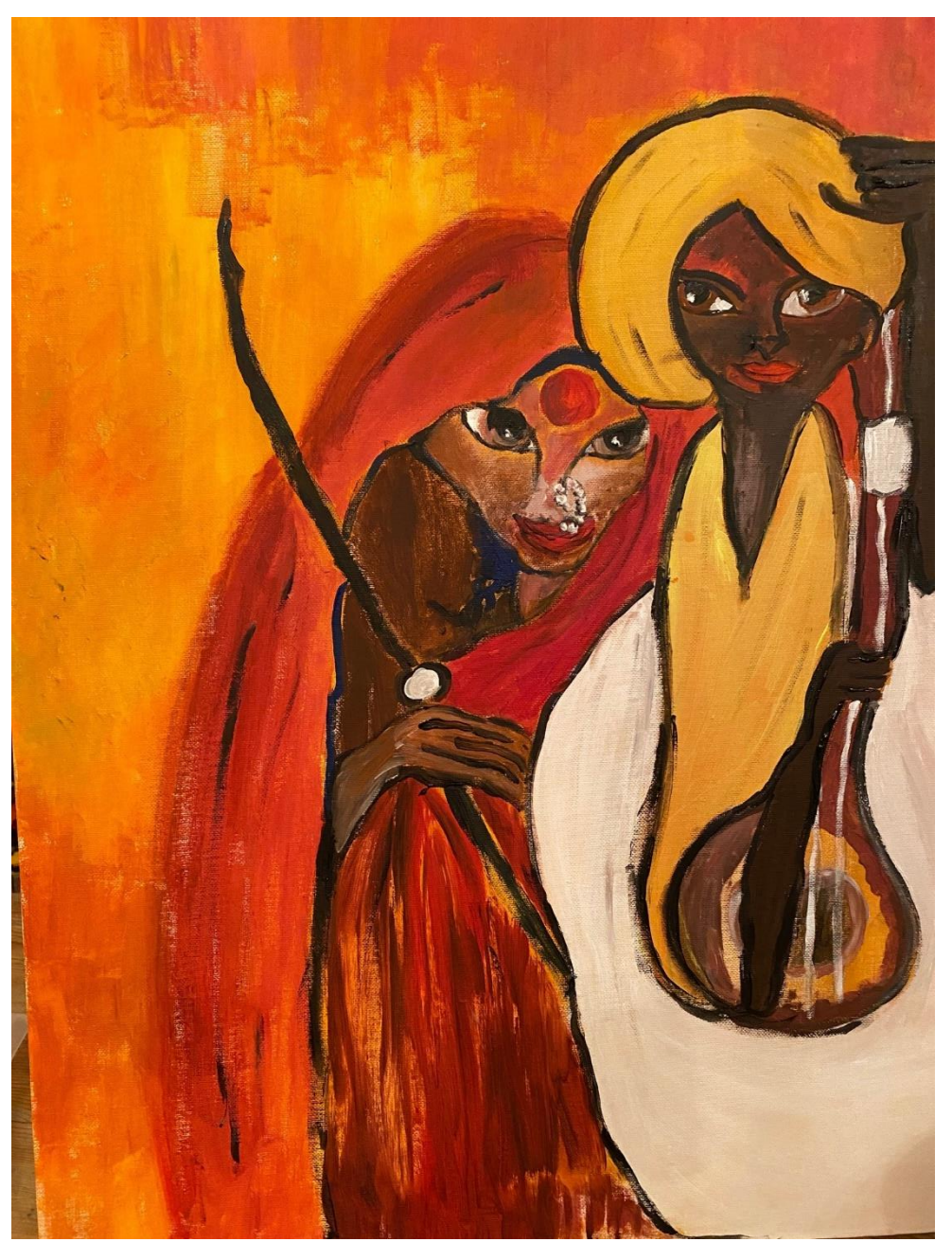
Figure 1: FOLK MUSICIANS

ST4 Gen Adult Psychiatry, SHSC NHS Foundation Trust