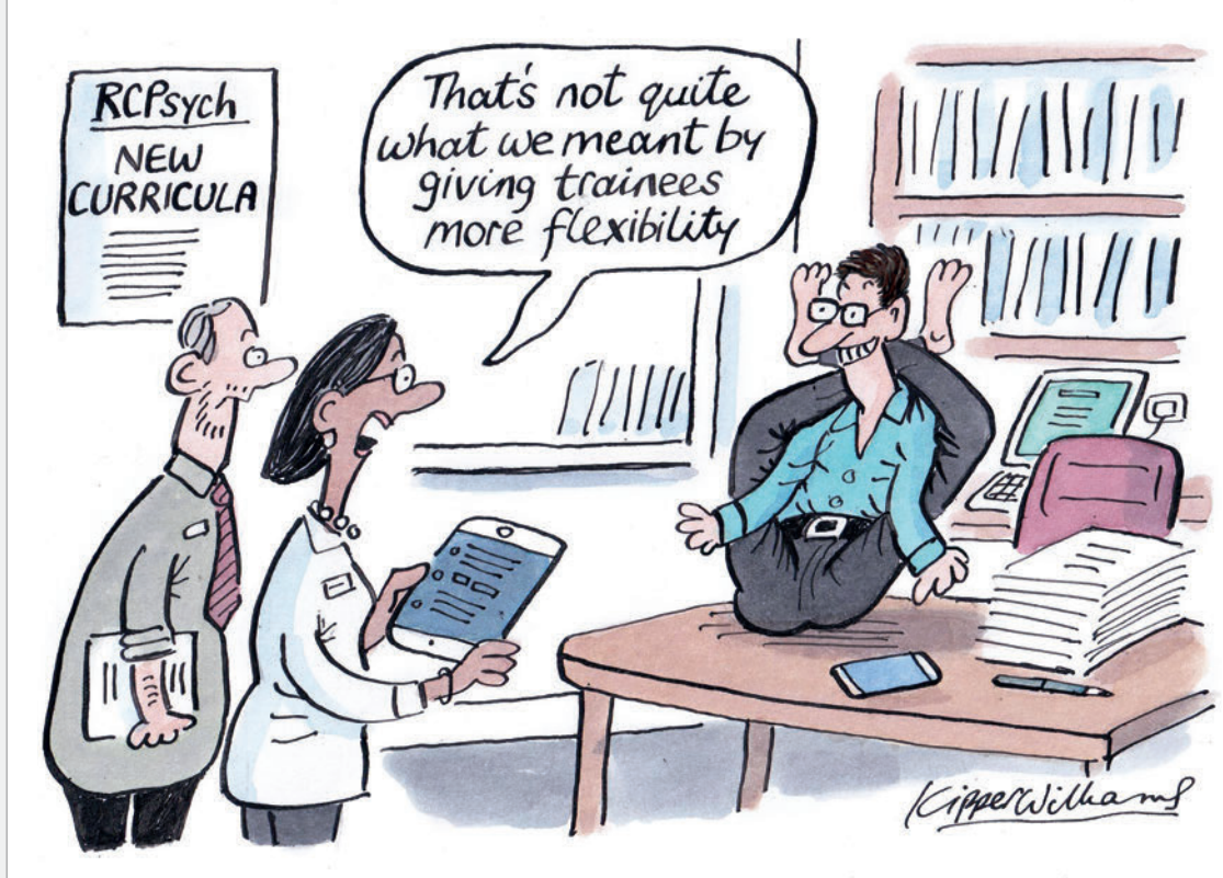
The new psychiatric curricula will provide flexibility for trainees to explore areas of interest. Find out more on pages 10-11

The strong media exposure on this important issue has allowed the College to get the message across and call upon the government for meaningful action.